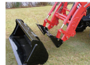
Universal skid steer quick attach system

-The heavy duty front axle offers greater traction during demanding applications