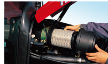
DUAL AIR FILTER ELEMENTS