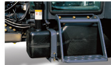
EASY FILL FUEL TANK

-The clear instrument panel provides fast and accurate information on all main operations