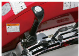
JOYSTICK LEVER FOR LOADER OPERATION